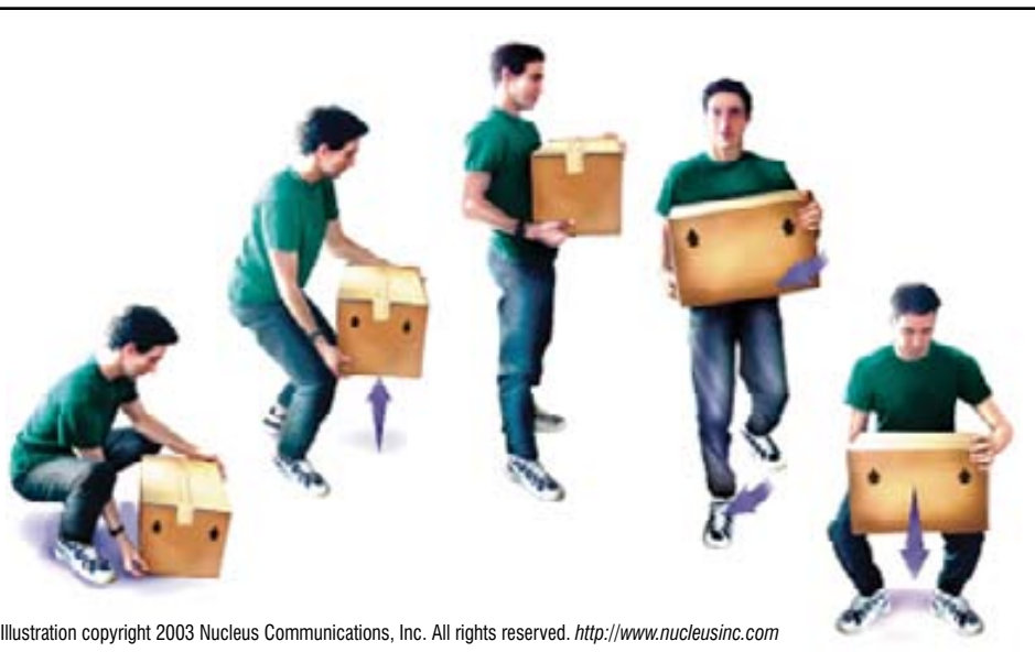
Illustration copyright 2003 Nucleus Communications, Inc. All rights reserved. http://www.nucleusinc.com